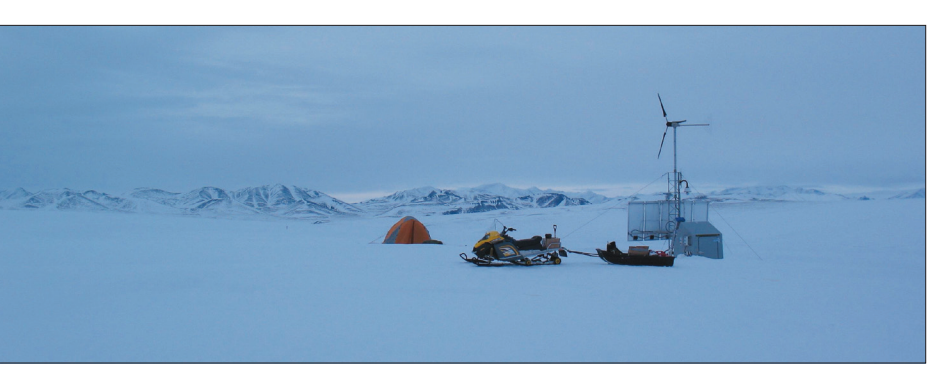
One of two solar and wind power systems currently at Imnavait Creek. As a pilot project this summer, CPS will install a methanol fuel cell at the adjacent site. The intent of the project is to improve data communications for both research sites by providing a more constant source of power while beta testing new technology in a field setting.

up to 40 NSF projects are expected to conduct fieldwork.