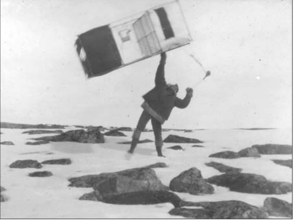
Members of the Canadian team at Chesterfield Inlet on Hudson Bay during the second IPY.

and temperature differences between polar and equatorial regions. These advances in meteorology became a vital component of weather forecasting and revolutionized commercial and military air travel, again demonstrating the social, economic, and political impacts of science.