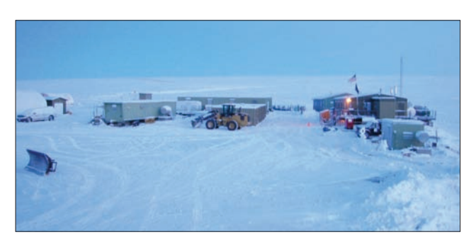
Toolik Field Station, located on Alaska's North Slope, has begun year-round operations and can support up to 20 researchers during the winter months of October through April.

Data management and Geographic Information Systems (GIS)/Information Technology (IT) services. Workshop participants recommended that TFS provide enhanced data management services, including a TFS-centric database, online data delivery, and GIS-integrated networks that link to data from other field stations. Infrastructure requirements for these data management improvements include yearround power and communications, on-site data storage backup, and wireless Internet capability with at least a 15 km range for sensor transmission from the field. Repeater towers for transmission from more distant sites may also be required.