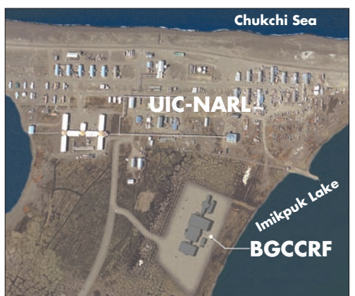
An aerial view showing the location of UIC-NARL and the five phases of the new Barrow Global Climate Change Research Facility (BGCCRF).

research in the area, and each phase of the new BGCCRF will significantly improve science support capabilities available to them in Barrow. The facility's grand opening, tentatively scheduled for June 2007, will coincide with the beginning of the