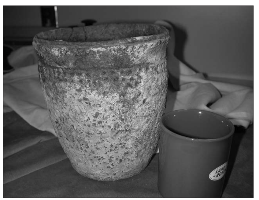
A ceramic cook pot from Nelson Island, which is located in western Alaska, next to a standard coffee cup. The pot is 18.5 cm tall by 16.5 cm in diameter at the rim. The walls are 5–6 cm thick. This pot is housed at the University of Alaska Museum of the North in Fairbanks.

After collecting locally available clays reported to have been used in ceramic production, the team, along with expert hand-mold potters Clint Swink and Cory Dangerfield, attempted to make cooking