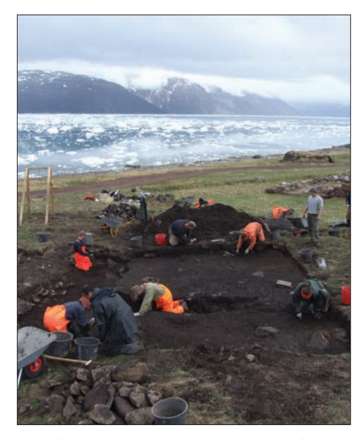
A North Atlantic Biocultural Organization research team excavates a site at Brattahlið, an ancient Norse settlement in southern Greenland. Approximately 250 residents live in the modern day community of Qassiarsuk, which is located right beside this site.