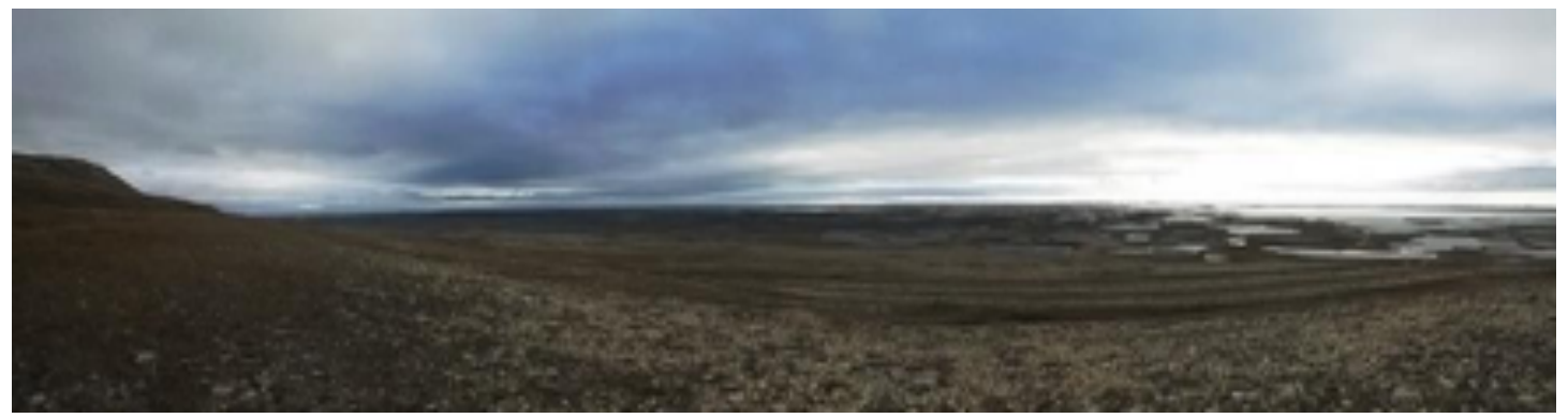
Cambridge Bay, Canada.

With this understanding Canada hosted a one-day meeting, facilitated by ICC that brought together IK holders to become familiar with CAFF, CBMP and to prepare for the Coastal Expert Group Monitoring workshop. The ICC facilitated the workshop. Though all Permanent Participants were encouraged to attend, they were unable to. Through the one-day workshop, participants held open discussions on the threats to biodiversity within their given regions, changes occurring; ways that IK directs daily monitoring activities; challenges and potential solutions for the inclusion of IK within CEMG; monitoring priorities and IK approaches to monitoring; what programs may be occurring within their respective regions that are based on IK and/or science and the potential benefits to taking part in CEMG.