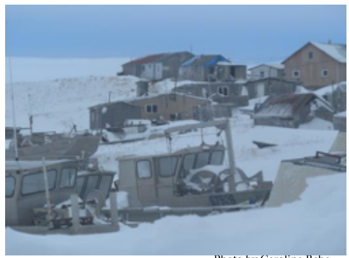
excrete all of it." – Quitsak Tarriasuk (Elder IK holder)

The challenge of where towns are located was discussed, and it was concluded that this was due to the engineers' lack of knowledge and not including Indigenous Knowledge. The towns were not located in areas where people lived [at the time]. Decisions were not made according to what was appropriate for the community. For example, a US [government] airstrip was placed in a village. The homes are too close only 30 feet apart. It becomes difficult to have space to dry meat, butcher food, etc. During the summer it is okay because people are working outside. But during the winter it is a challenge. Everyone is in the house and the house becomes too crowded. There is also a problem wit inadequate sewage tanks. This is common throughout the Arctic. It impacts peoples' quality of life negatively. -IK holder participants