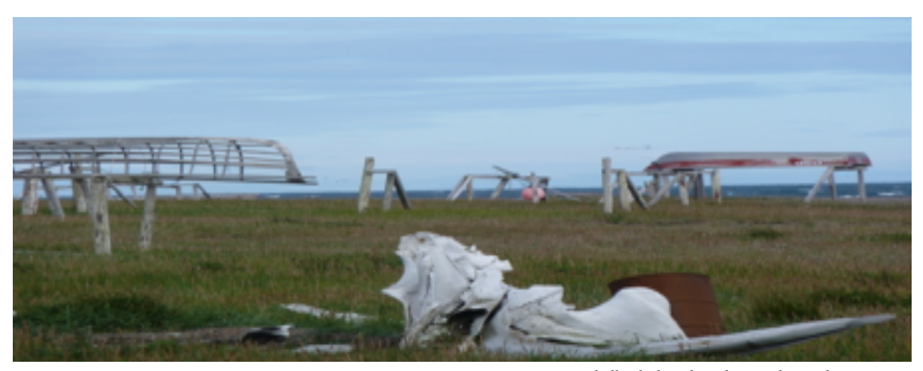
Gambell, Alaska.

Roots Wolves Narwhal Muskrats Lemmings Phytoplankton Ice seals Grey whale Mosquitos Bowhead whale Sea urchin Crab Killer whale (Orca) Grizzly Parasites