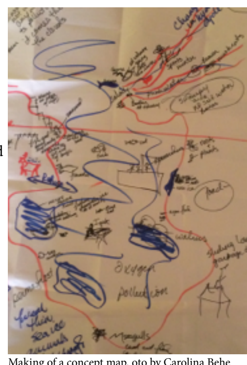
Making of a concept map.

The maps demonstrate activities occurring across the entire North America Arctic coastline. geese, sitting on nests or guarding chicks on coast; oogruk (bearded seal) near the ice, sunbathing on floes no predators; ducks in the water near the ice; th seagulls come first, then the ducks; murres lay eggs last on giant cliffs; beluga are feeding at the mouth of the river, and come to rub on rocks in freshwater molting; clams and mussels at mouths of river where fresh and salt water is