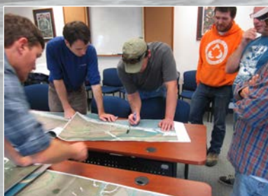
Nome Tribal Climate Adaptation Planning