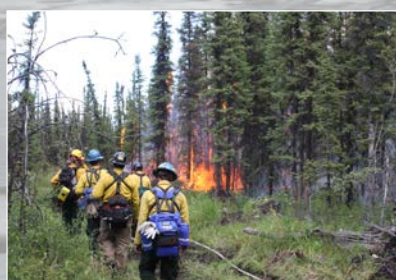
Supporting trusted organizations