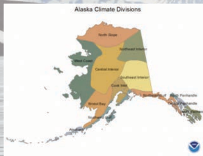
Creating Alaska Climate Divisions