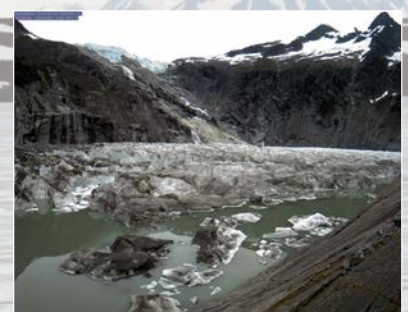
Glacial outburst floods