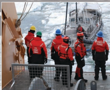
Co-producing sea ice hazard tools