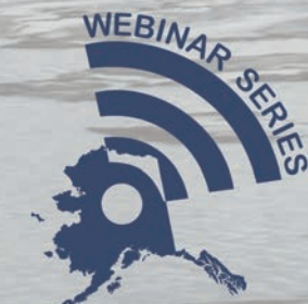
Alaska Weather and Climate Webinars