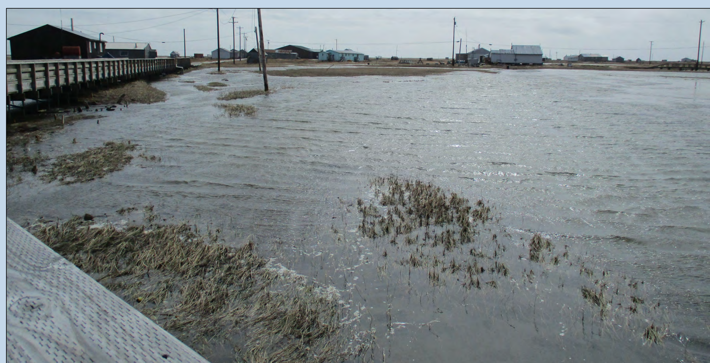
Water overflow on a calm day during high tide.