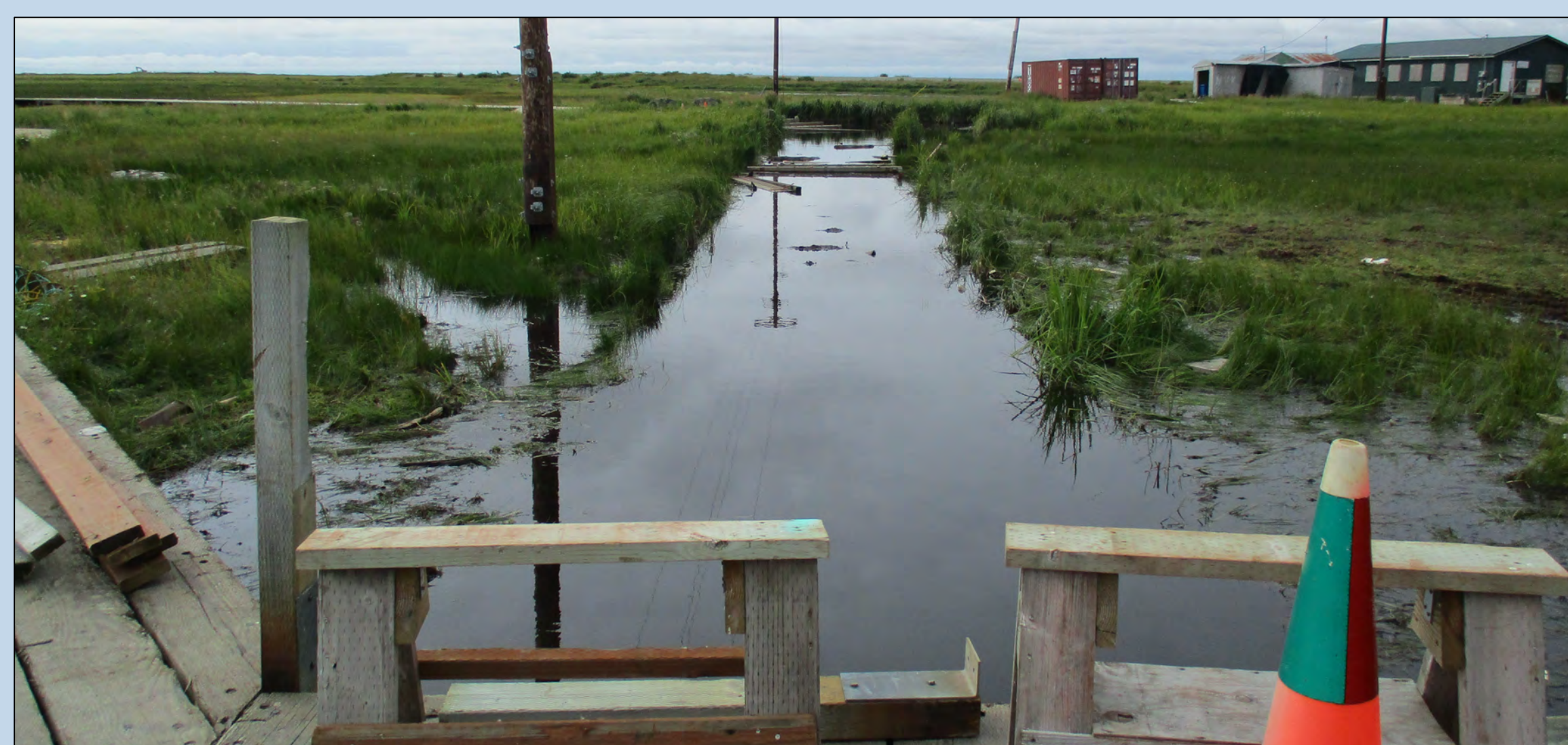
Water ponding due to permafrost thaw.