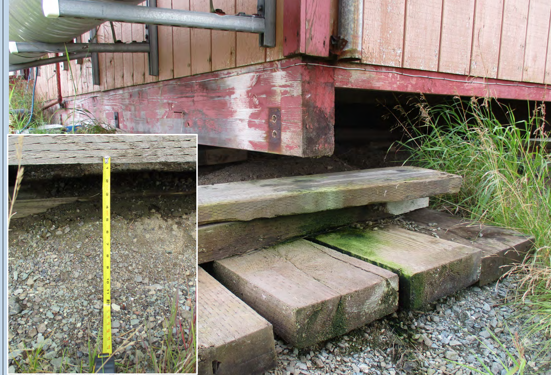
Documenting the impact of ground thaw on infrastructure. Inset: depth of ground collapse.