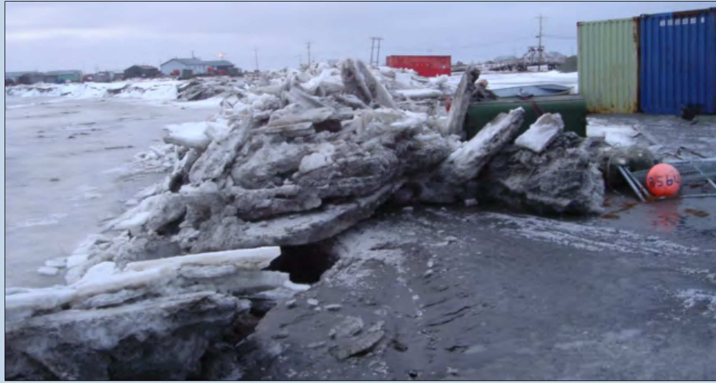
Ice piling up after a storm and high water event.