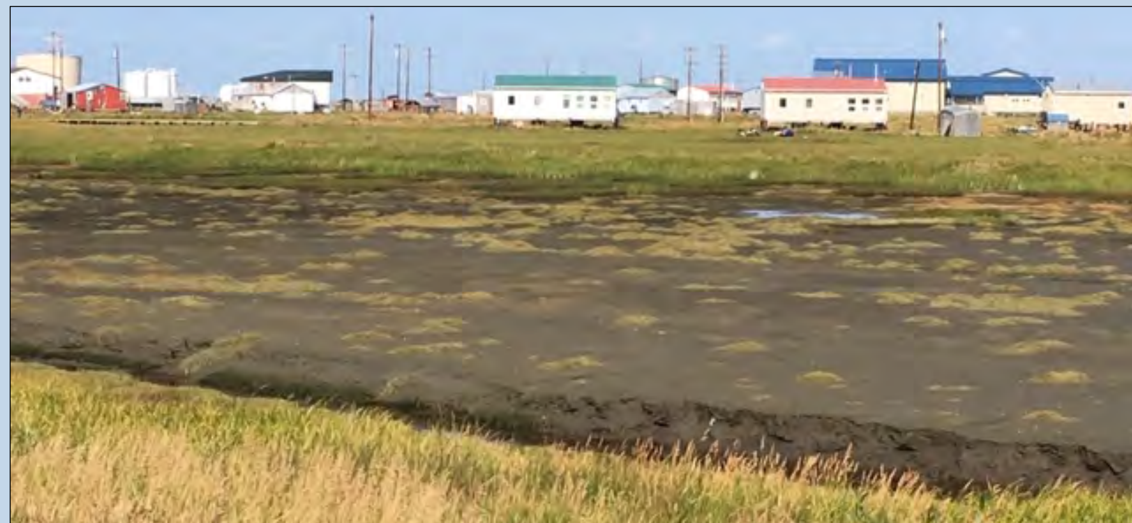
A recently dried lake.