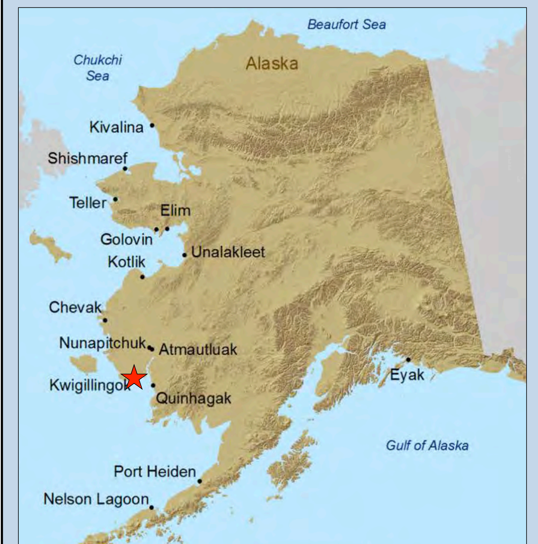
Some of the climate-change impacted communities in Alaska.

Working together to monitor change and to develop an adaptation plan.