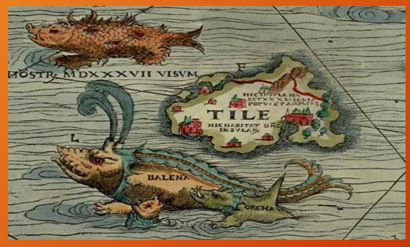
Olaus Magnus's Carta Marina (1539)