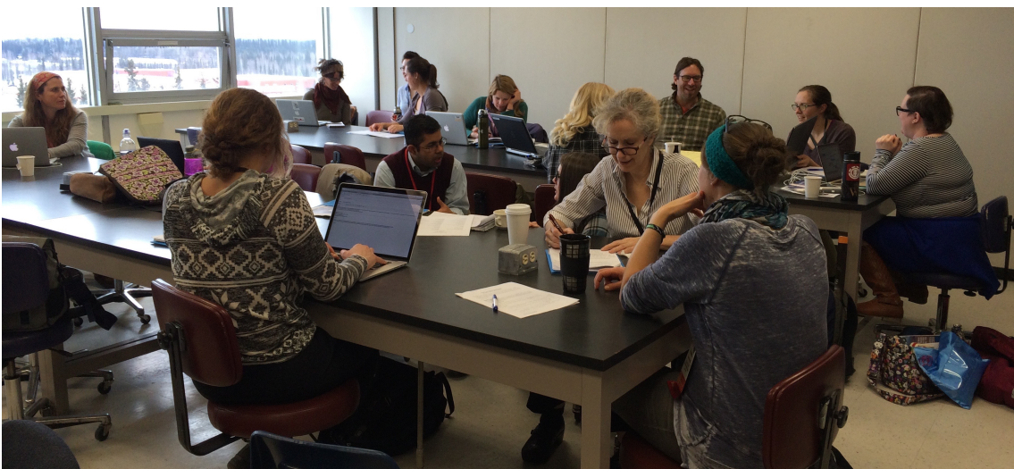
Workshop participants formed groups based on criteria such as science/education goals, geography, and other professional interests. Significant workshop time was spent in these groups developing their ideas for collaboration.

Days one and two of the workshop were dedicated to building a professional community of educators and researchers that are working, conducting research, living, and/or teaching in arctic communities. Participants and expert presenters shared their knowledge, experience, and advice to co-create the workshop space for collaboration. Day three of the workshop leveraged the common day events of the concurrently held Arctic Science Summit Week (ASSW) that brought over one thousand scientists, policymakers, and stakeholders to Fairbanks, Alaska for 12-18 March 2016.